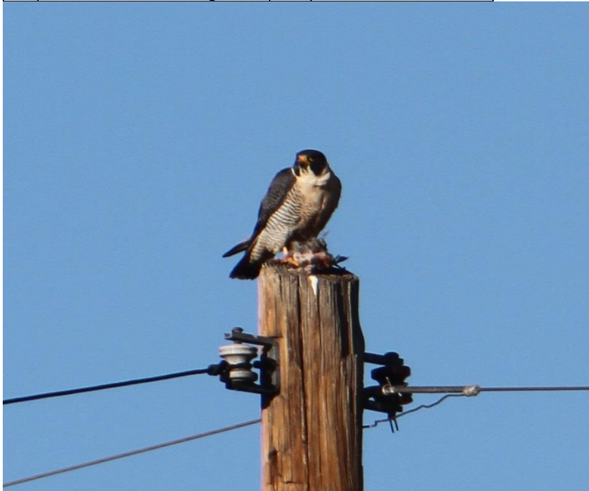
Peregrine Falcon eating lunch.