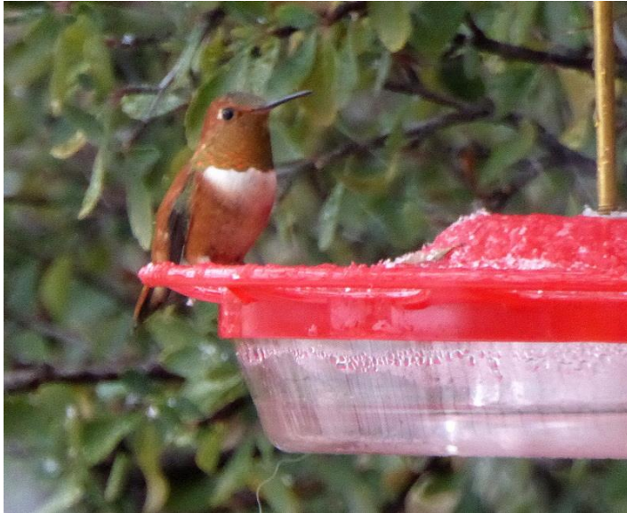
Rufous Hummingbird Courtesy of Beth Leuck (feeder count)